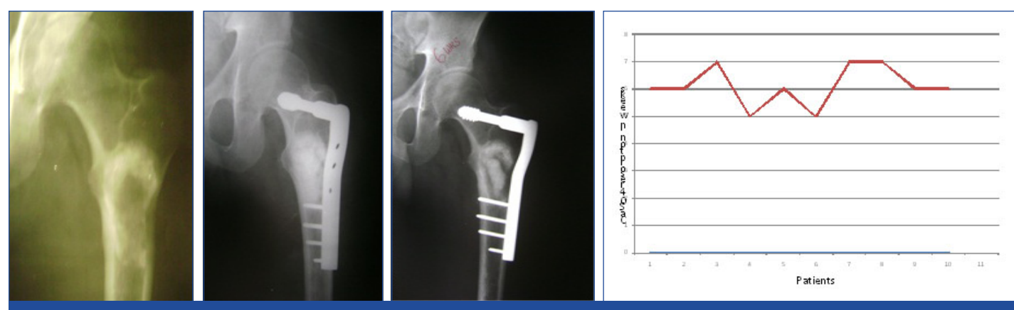
[Table/Fig-1]: Fibrous dysplasia Proximal Femur [Table/Fig-2]: Postoperative day 1 [Table/Fig-3]: Radiograph at six weeks showing calcium sulphate resorption

Aseptic discharge was a common complication seen in 8 cases, but it was self limiting and responded to simple saline dressing. There was no incidence of hypercalcemia, soft tissue calcification or persistence of infection.